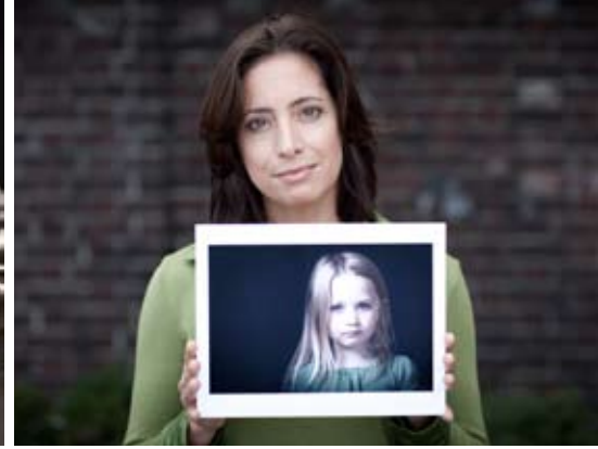
CASA volunteers make a difference in the life of a child. That difference maker can be you.