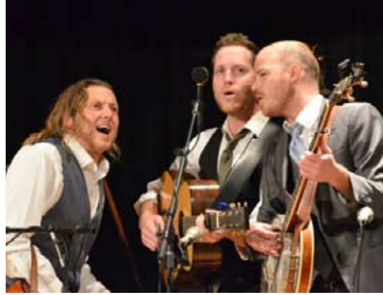
In just its second year, attendance was maxed out at the 2013 CASA Bluegrass event.